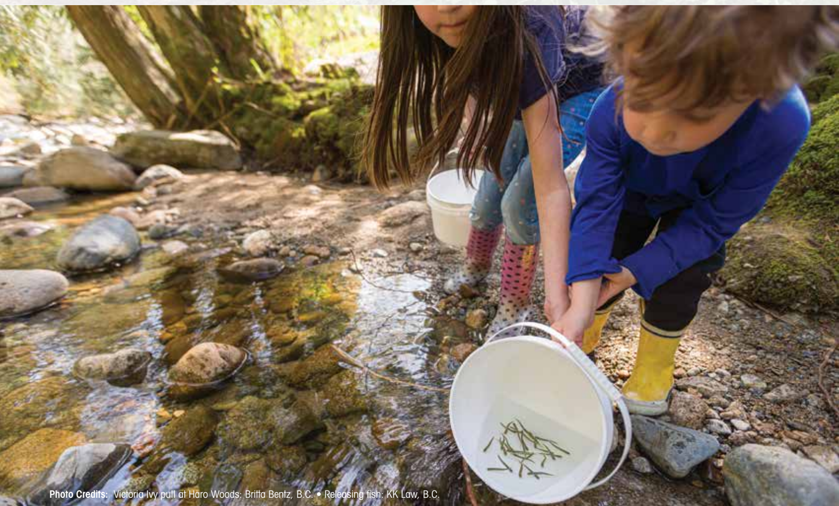
Victoria Ivy pull at Haro Woods • Releasing fish

NatureKids BC (Young Naturalists' Club of BC Society) is a registered charity. Charitable #: 84961 1926 RR0001. 1620 Mt. Seymour Road, North Vancouver, BC V7G 2R7 • 604-985-3059 • info@naturekidsbc.ca • naturekidsbc.ca